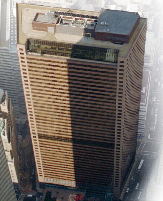
WTC 7 WAS A 47-STORY HIGH-RISE ON THE NORTH SIDE OF THE WTC COMPLEX.