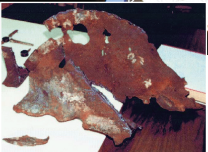
PREVIOUSLY MELTED STEEL FROM WTC 7 (THE SAME PIECE AS SHOWN ABOVE).