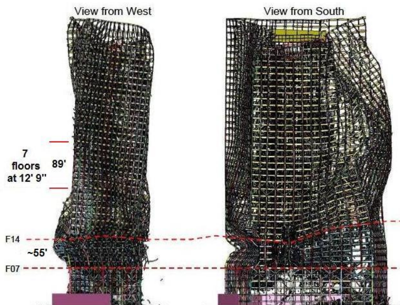
Figure 12-62. Exterior column buckling after initiation of global collapse with debris impact and fire-induced damage (slabs removed from view).

The NIST model (below) shows the exterior framework still bending after about 34 feet of descent, well into the free-fall portion of the collapse. In free fall, all the energy is being converted into motion, but bending steel requires energy, so the NIST model is not falling at free fall.